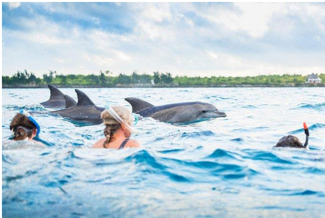
Swimming with Dolphin