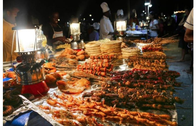
Zanzibar food taste and delicacy at Forodhani