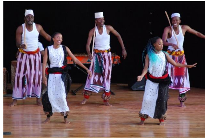
Cultural dancing experience